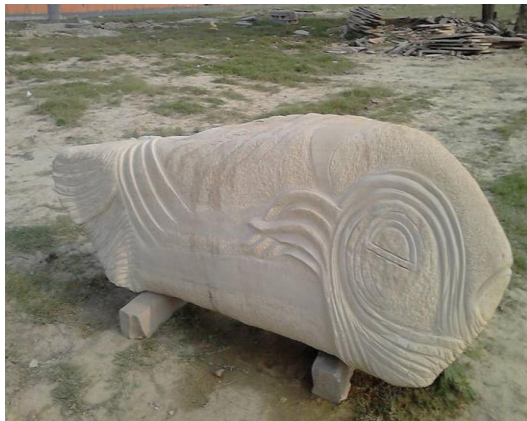
Figure 1 unutilized sand stone

meeting Shiv Balak, the researcher posed many questions to him, who is of the opinion that the creator is never empty. There are always some creative ideas in the mind of the artist. His way of working in Black Marble is somewhat different. Shiv Balak does not take stone size too big. They say that I would have smiled with a big stone handle. Bringing small work is easy to carry. Shiv Balak also did many experiments in stone, such experiments which were also chemical. It is very important to read the nature of the stone before the stone cut. Stone himself wants to have a good relationship with the artist, he knows that every hit of the hammer-chisel will hurt me, yet he adopts it. He did much work about the realistic form. He also did her part time job after collage.