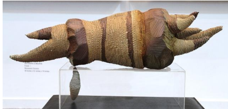
Figure 5 FROM PAST TO PRESENT I_STONEWARE_55x55x96 Figure 6FOSSIL I_STONEWARE CERAMIC, ACRYLIC GLASS

The Academy of Fine Arts continues to encourage young artists from time to time by giving them space inside the academy.