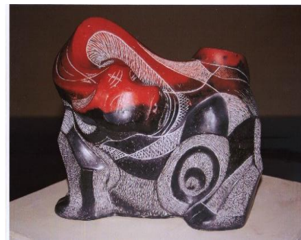
Figure 2. nandi, marble